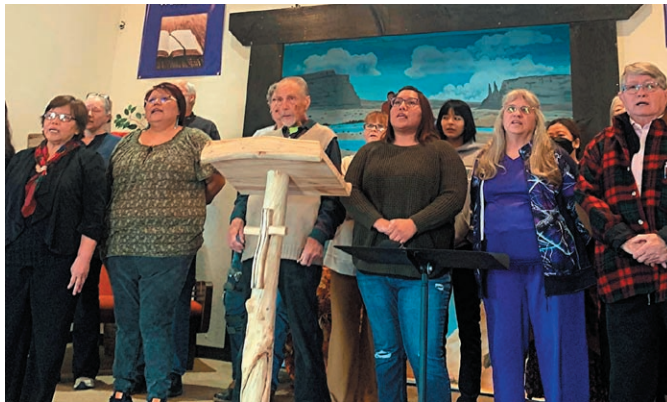
LVM staff members singing during opening worship at the October board meeting