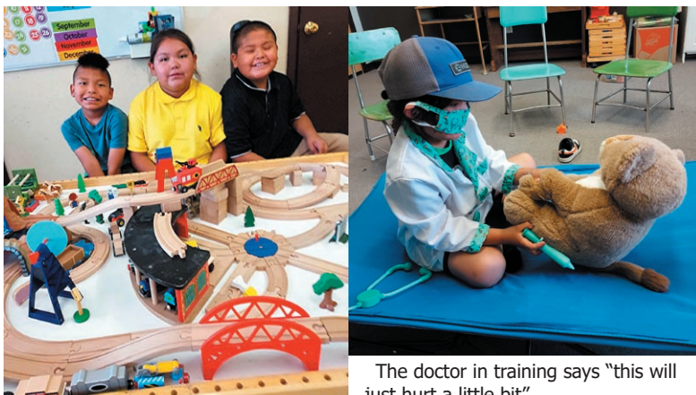
The doctor in training says "this will just hurt a little bit".