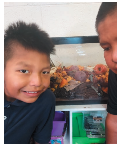
Science class: How long will it take to decompose after we cover it with dirt? Can you submit a guess?